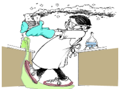
We want to avoid this.

34. Never look into a container that is being heated.